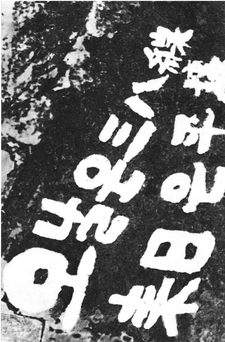
The enemy's slogan put up for "northward-attacking" war:"Today the 38 th Parallel, tomorrow Pyongyang"