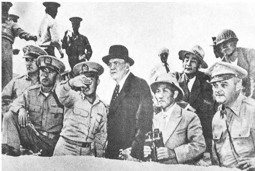
Dulles making final examination of the plan of invasion of the northern half of the Republic in a trench along the 38 th parallel (June 18, 1950)

Bradley and MacArthur, in the square in front of the Imperial Palace in Tokyo. ( Asahi Shimbun dated June 20, 1950.) This represented a challenge to and military pressure on the Korean people in their efforts for peaceful reunification and a provocative act aimed at implying what "positive action" would be like.