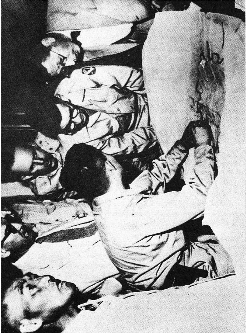
US ambassador in south Korea Muccio examining preparatopns for the armed invasion of the northern half of the Republic(July 1949)