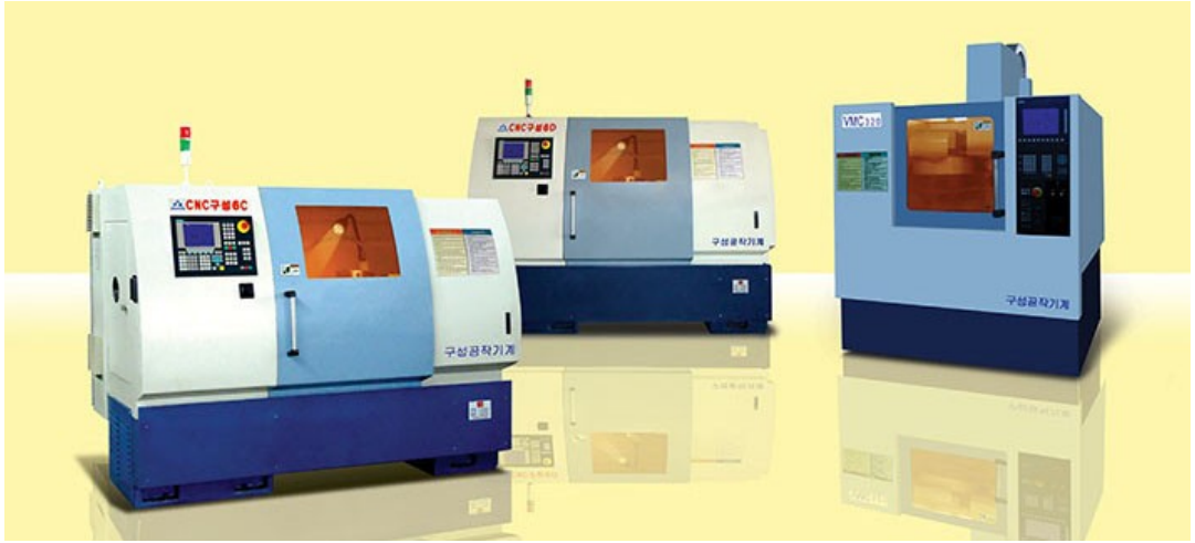
Advanced models of CNC machine tools produced in the DPRK