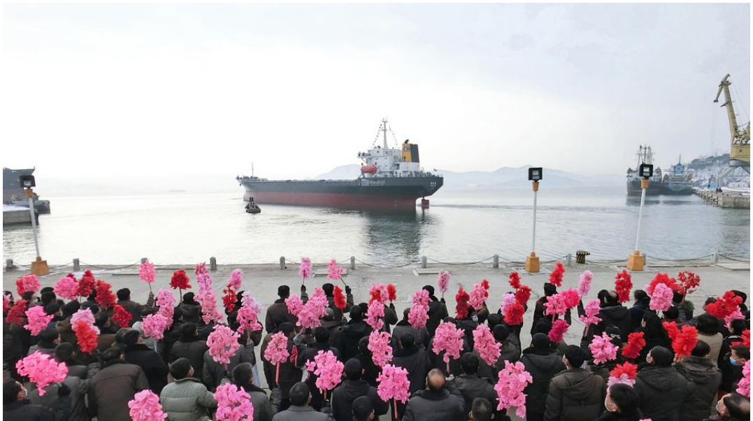
A 12 000-ton-displacement cargo ship sets sail