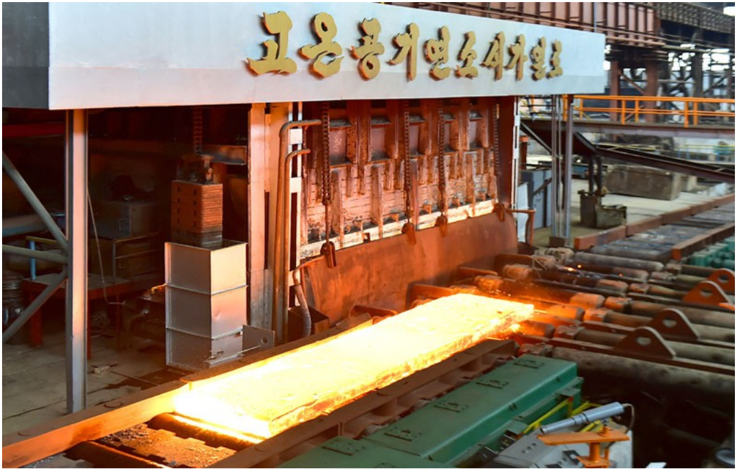
The DPRK's steel industry based on a self-supporting production system