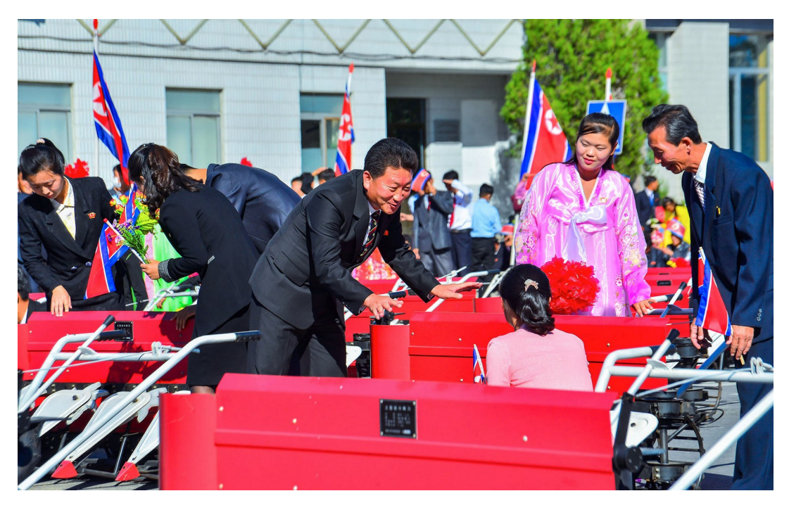
Agricultural workers full of delight upon receiving the farm machines

Rows of the farm machines will cover 60 000 square metres, or the areas equivalent to eight football grounds put together, a line of them will be as long as 20 kilometres and 3 000 trucks will be needed to carry them.