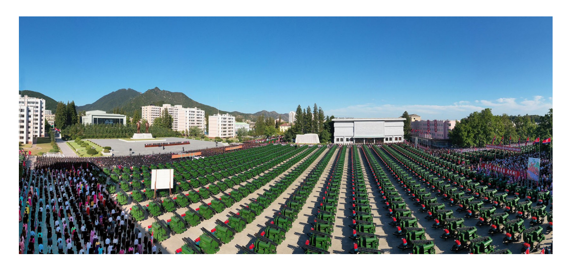
Ceremony for conveying farm machines held in Haeju Square in South Hwanghae Province in late September