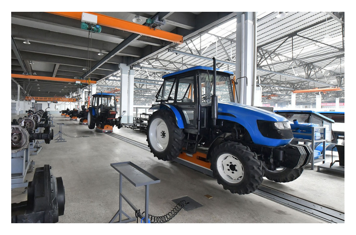
Part of renovated tractor production lines