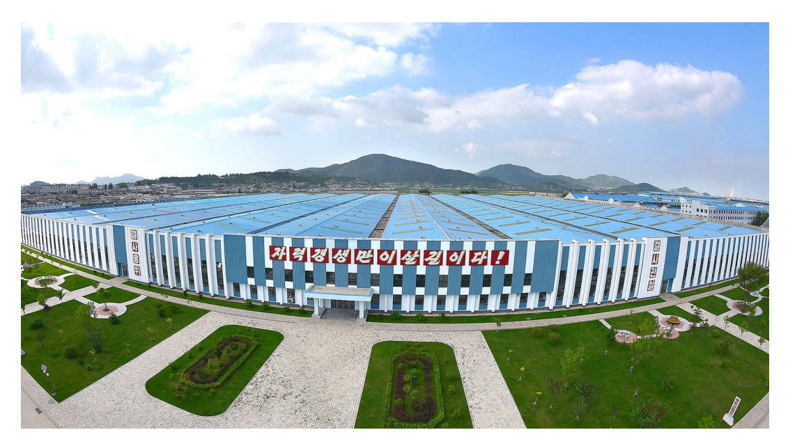
The first-stage modernization of the Kumsong Tractor Factory inaugurated in November