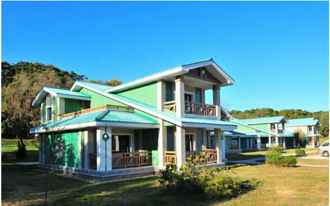
Facilities for the visitors