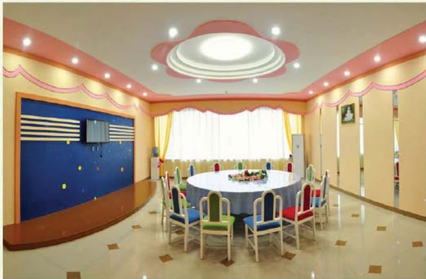
Room for birthday party