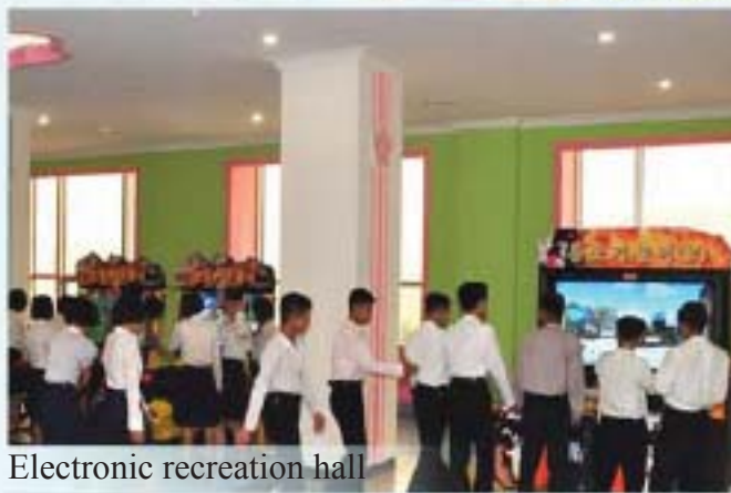
Electronic recreation hall