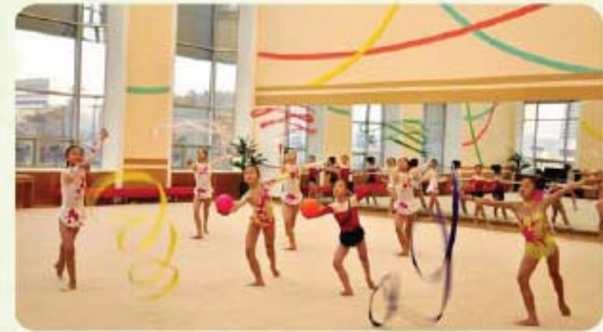
Rhythmic gymnastics training area