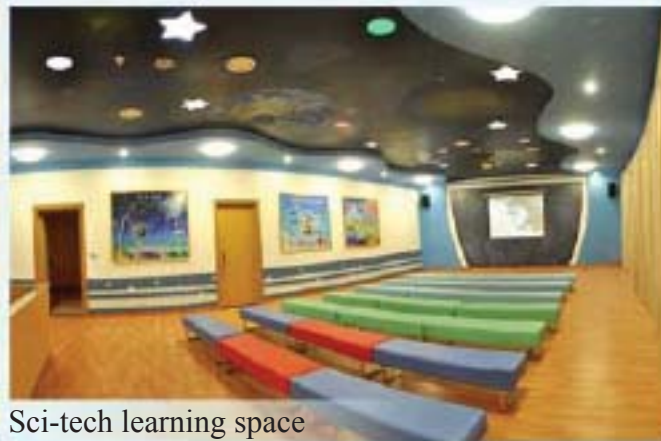
Sci-tech learning space