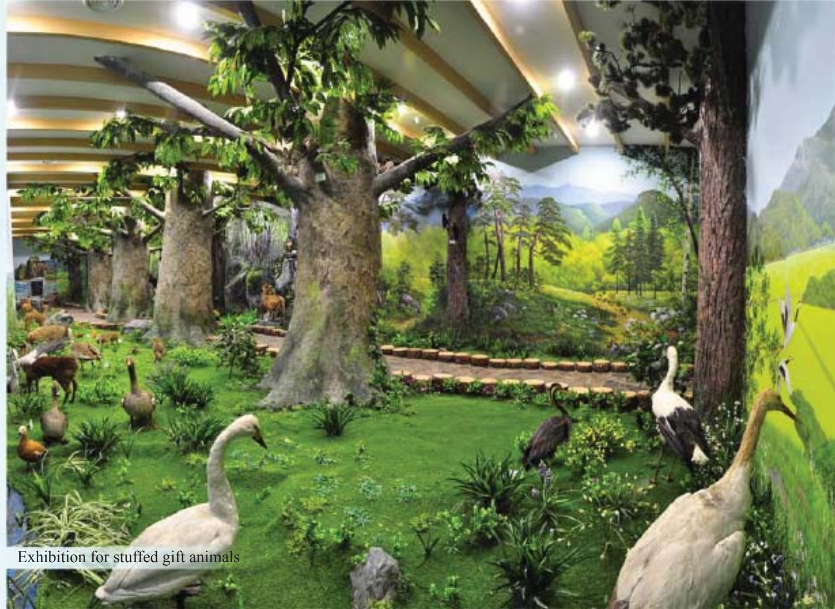
Exhibition for stuffed gift animals