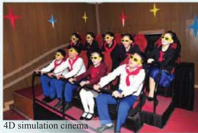
4D simulation cinema