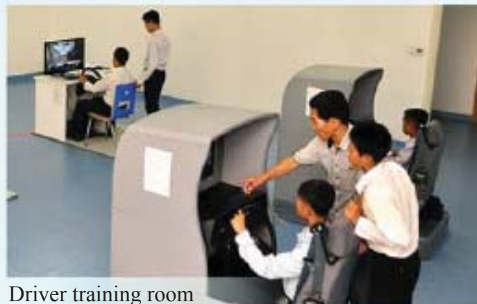
Driver training room