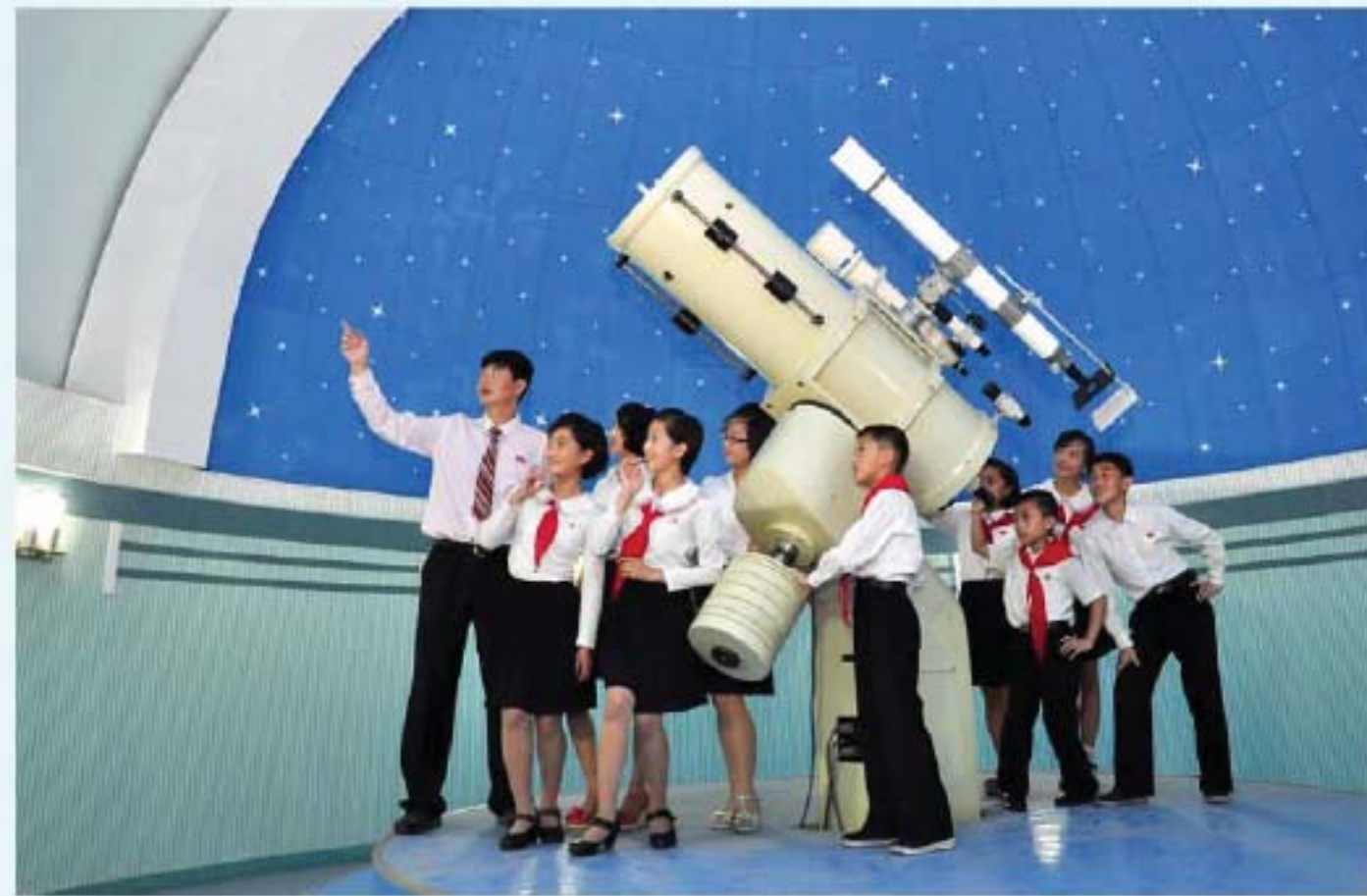
Astronomical telescope room