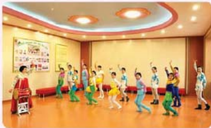
Public activities group