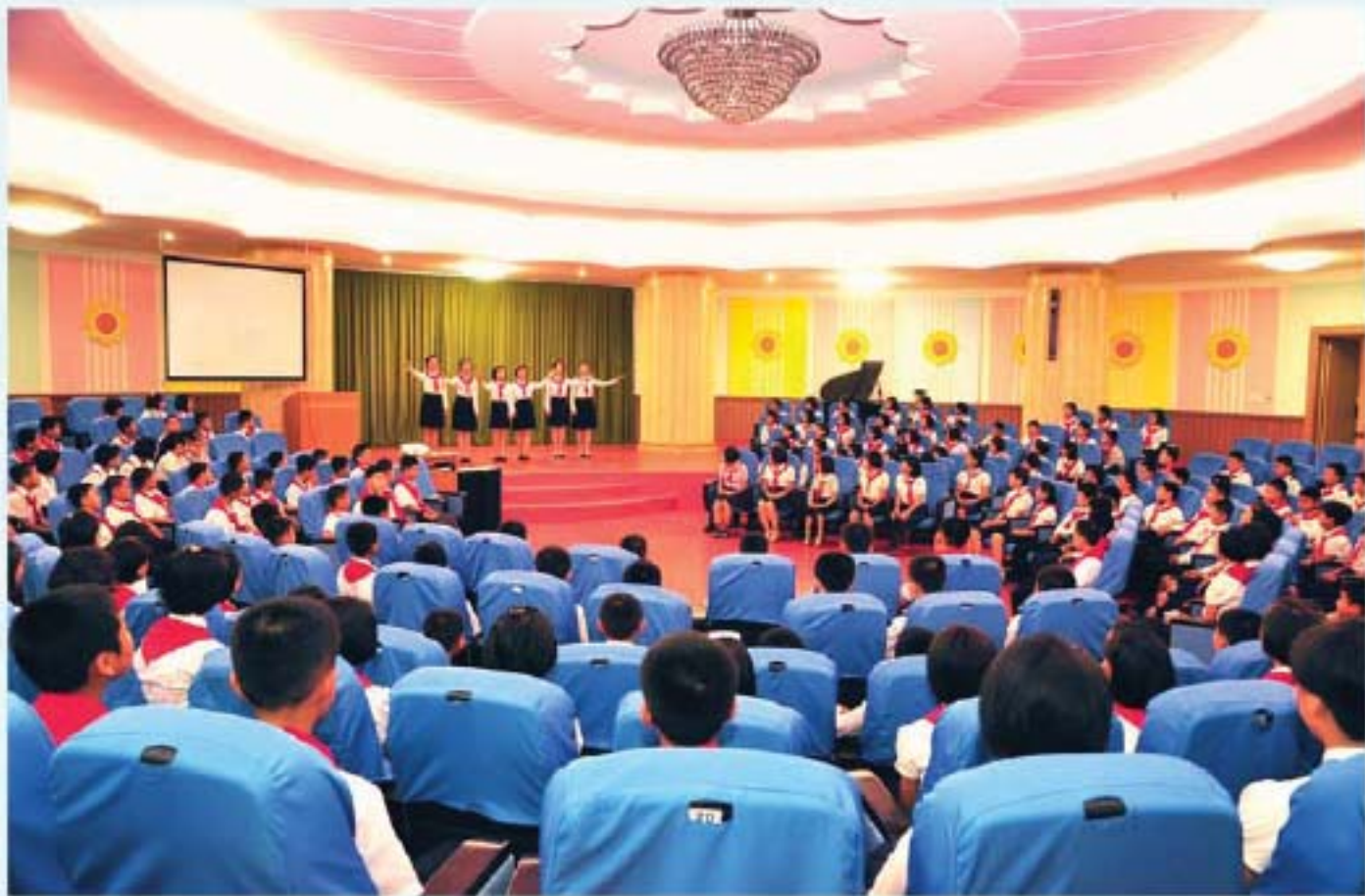
Public activities room