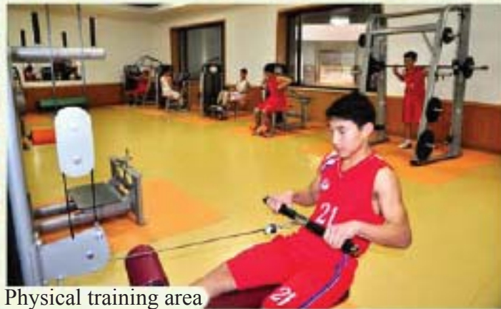
Physical training area