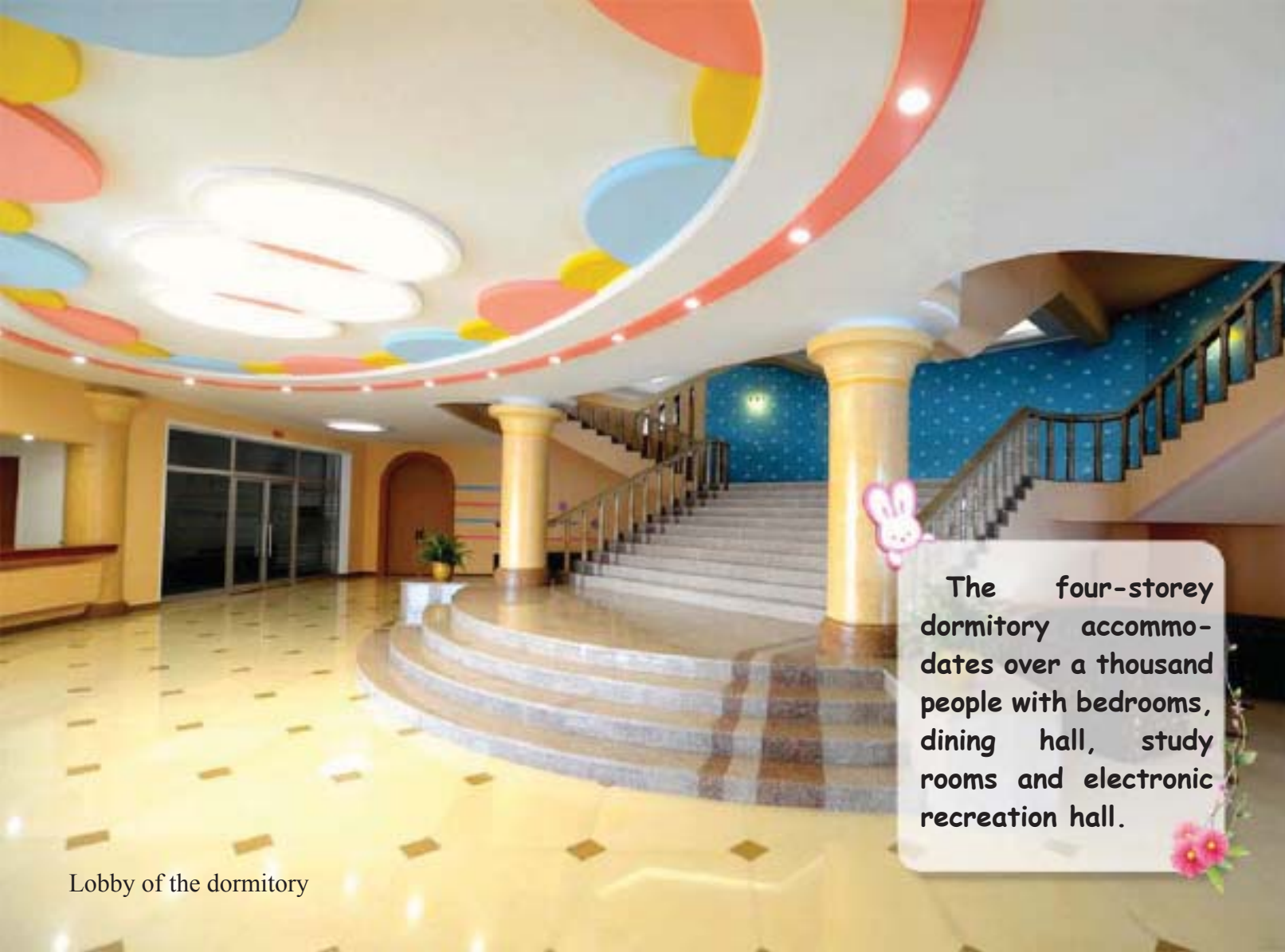
Lobby of the dormitory

The four-storey dormitory accommodates over a thousand people with bedrooms, dining hall, study rooms and electronic recreation hall.