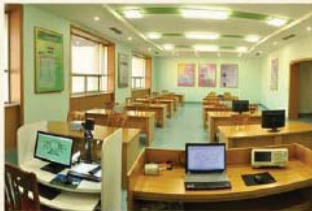
Electronic devices group