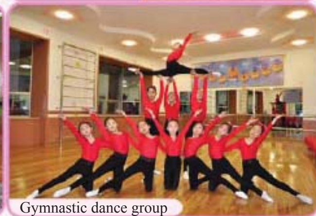
Gymnastic dance group