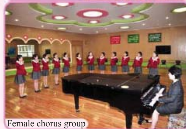
Female chorus group