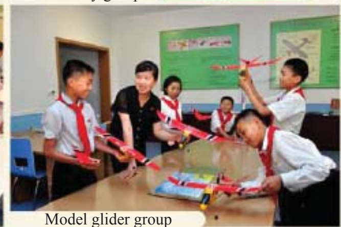
Model glider group