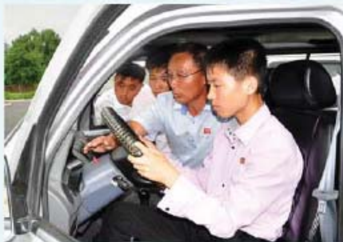
Driver training lot