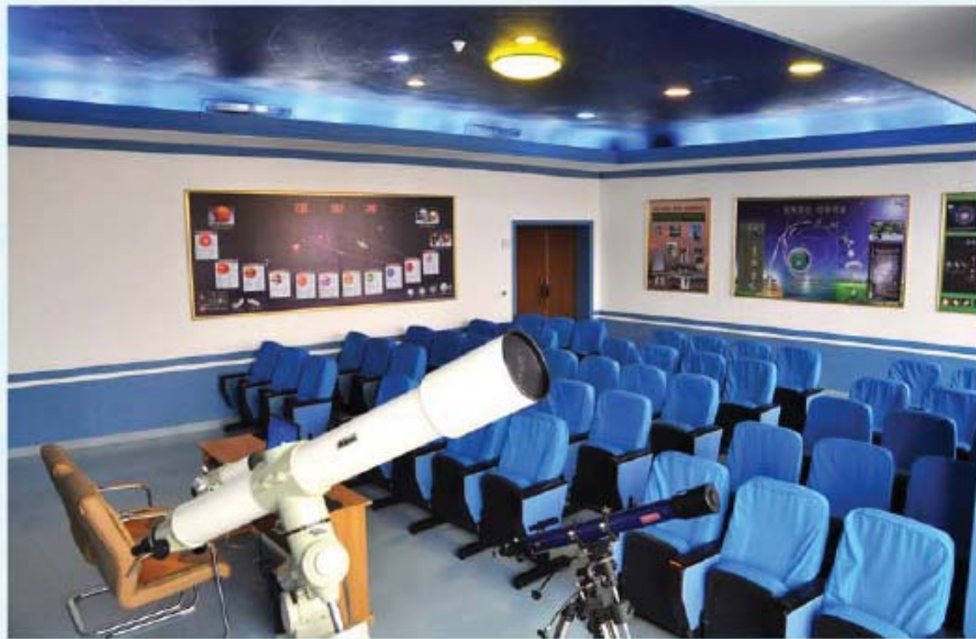
Astronomical knowledge room