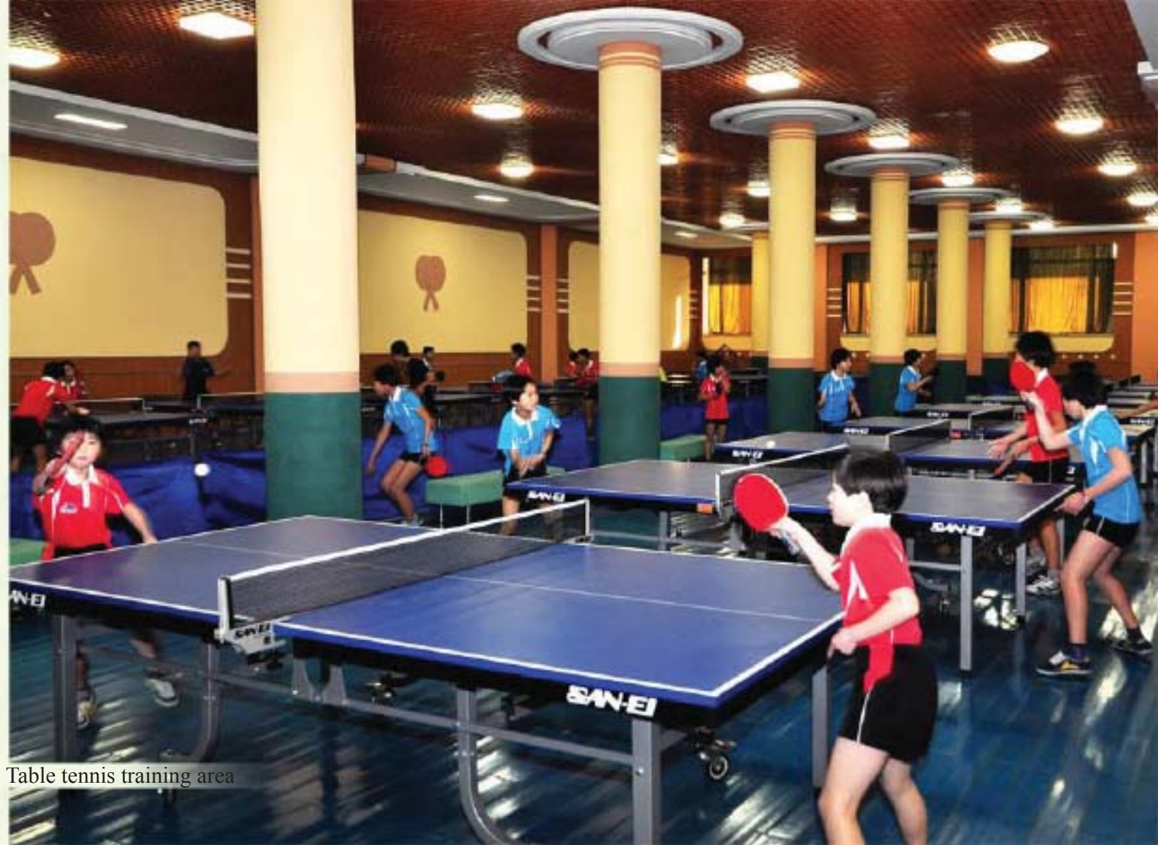
Table tennis training area