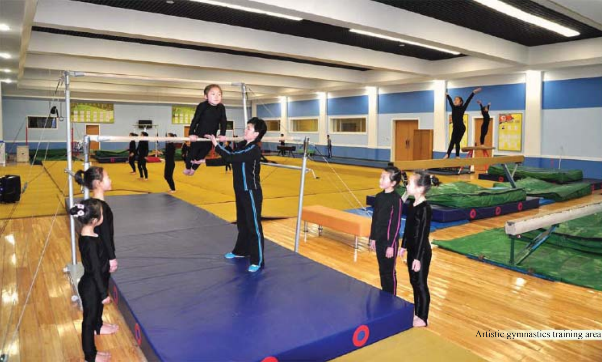
Artistic gymnastics training area