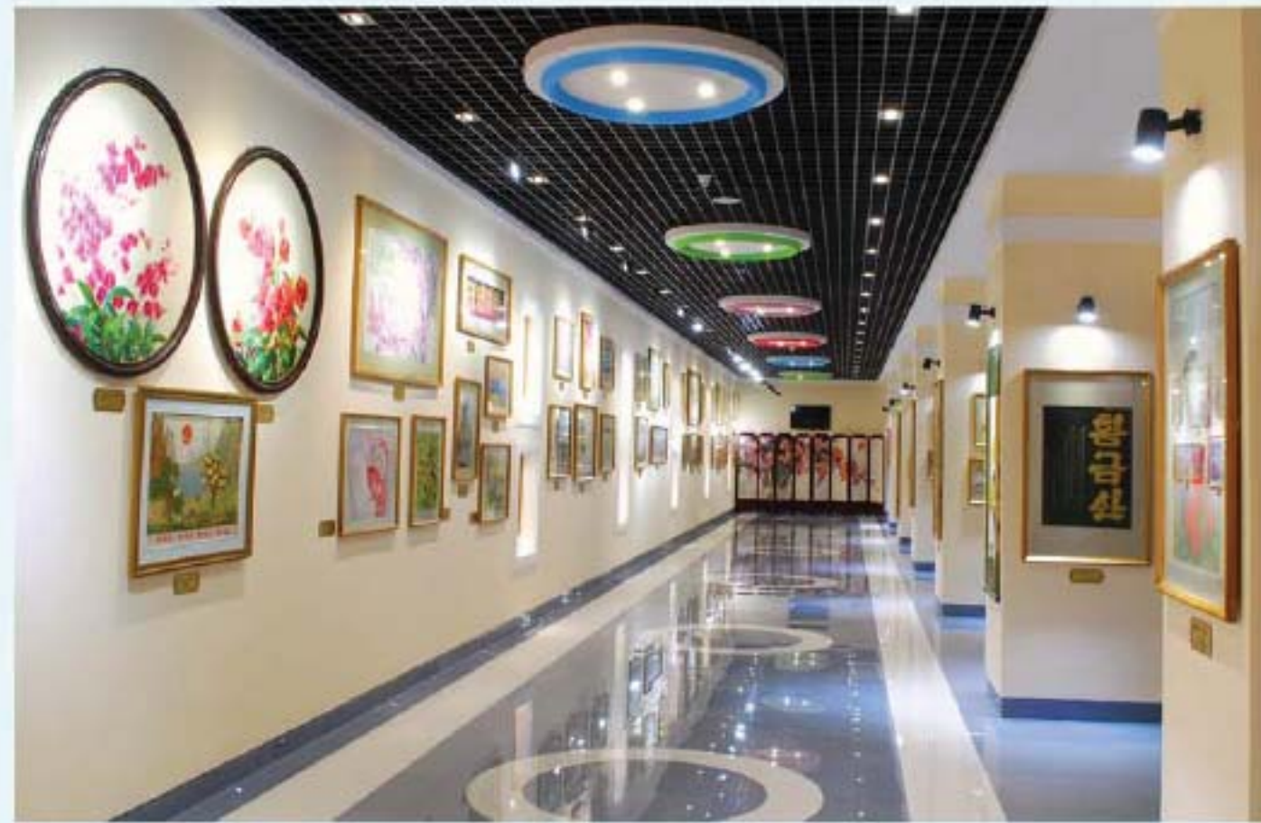
Hall for art works exhibition