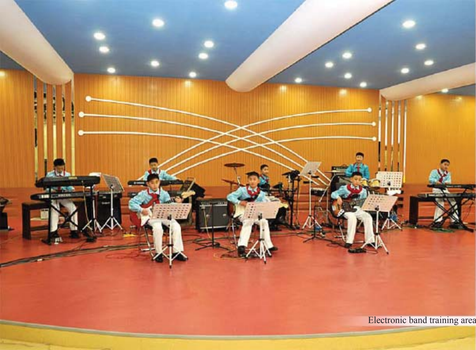
Electronic band training area