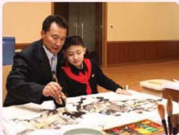
Fine art group