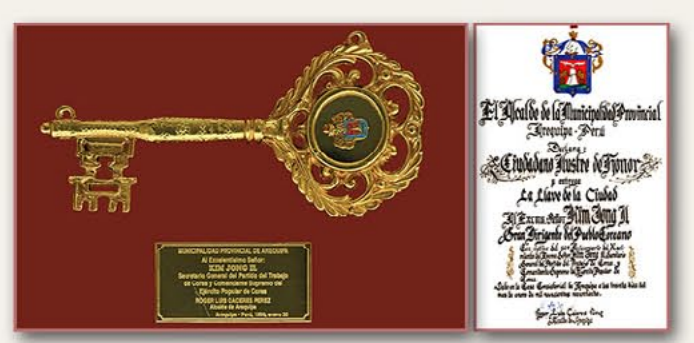
Key to Arequipa and its Honorary Citizenship certificate (Peru) January 30, 1998