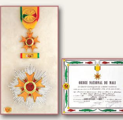
National Grand Cross Order and its certificate (Mali) December 17, 1992