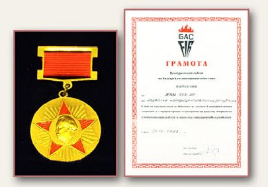
Anti-Fascism Union Medallion and its diploma (Bulgaria) February 5, 2002

"Grand Address of Tribute 2000" Certificate (Pakistan) November 25, 2000