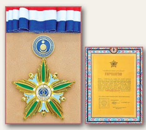
Gold Star of Friendship Order and its certificate (Mongolia) February 13, 2007