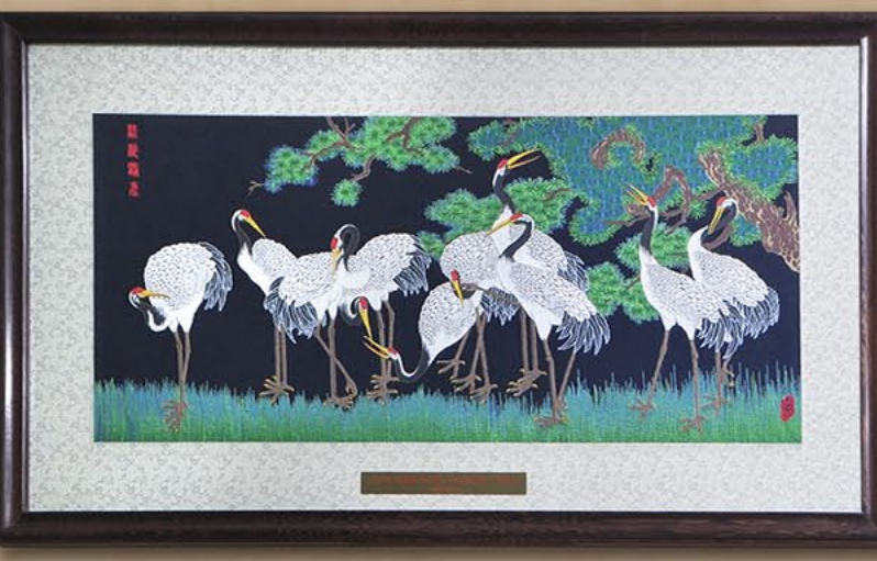
Textilework Cranes and a Pine Tree from Wen Jiabao, premier of the People's Republic of China and member of the Standing Committee of the Political Bureau of the Central Committee of the Communist Party of China October 2009