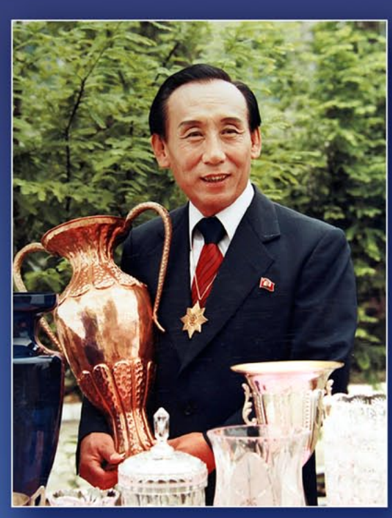
Kim Thaek Song won the Grand Prix and the title of "King of World Magic" at the 16th International Festival of Modern Magic