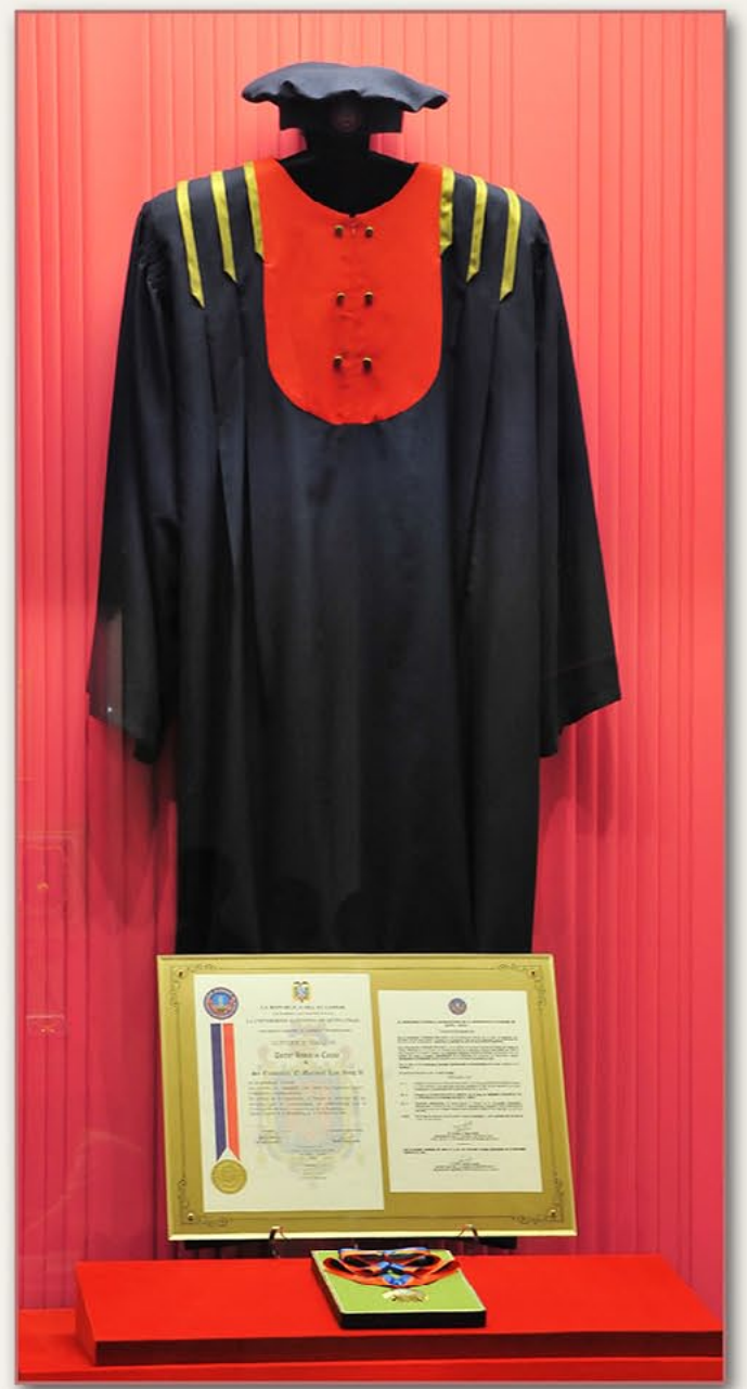
Quito Autonomous University Honorary Doctor (Diploma, Resolution, Gown, Cap and Medallion) (Ecuador) March 27, 2001