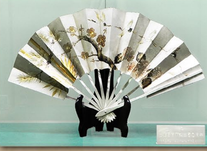
Silverwork Folding Fan from the International Institute of the Juche Idea February 1992