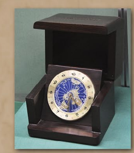
Table clock from the President of the ABC of the USA April 1995