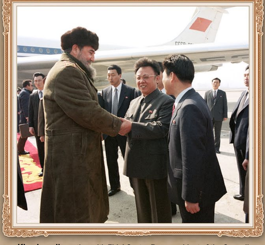
Kim Jong II meeting with Fidel Castro Ruz, president of the Council of Ministers of the Republic of Cuba, in March 1986