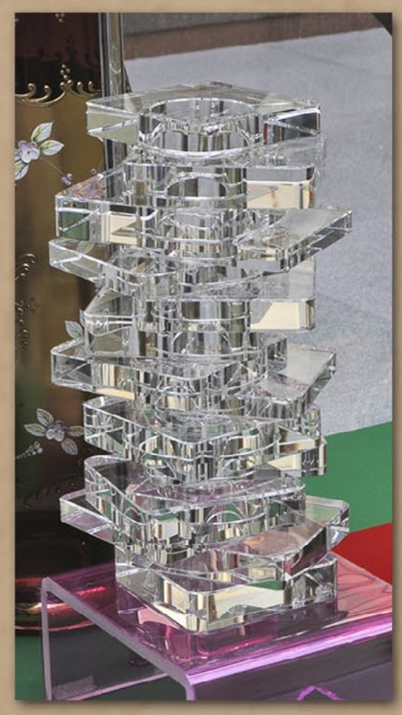
Crystal vase from the General Manager (Indian) of the Bin Al Shehik Rebar Factory, Qatar February 2009