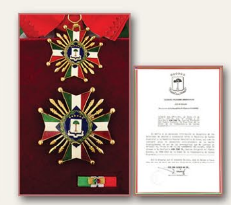
Grand Cross Order of Independence and its decree (Equatorial Guinea) April 13, 1992