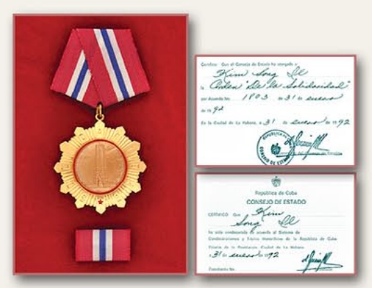
Order of Solidarity and its certificate (Cuba) January 31, 1992