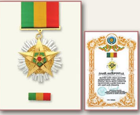
Order of Grand Star of Honour 1st Class and its certificate (Ethiopia) November 16, 1985