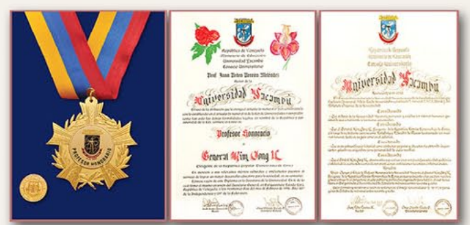
Yacambu University Honorary Professor (Medallion, Badge, Diploma and Resolution) (Venezuela) October 15, 1997