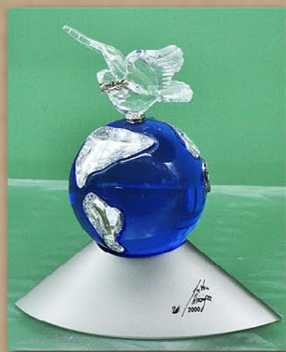
Crystal work Symbol of Peace from the Festo Delegation of Bulgaria May 2002