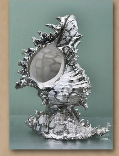
Turban-shell table lamp from the Speaker of the Senate of the Republic of the Philippines April 2006