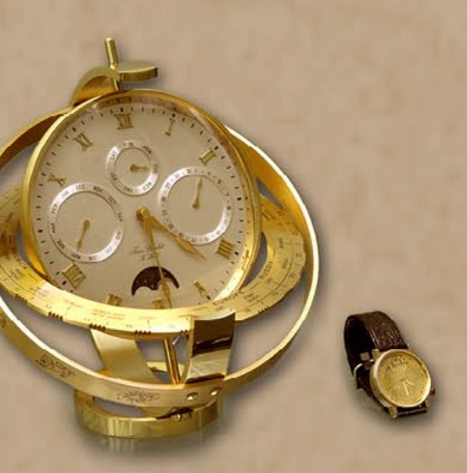
Gold table clock and wristwatch from a delegation of the Geneva Club, Switzerland April 1989