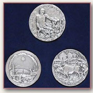
Medallion of World Food Day (United Nations Food and Agriculture Organization) September 9, 1983