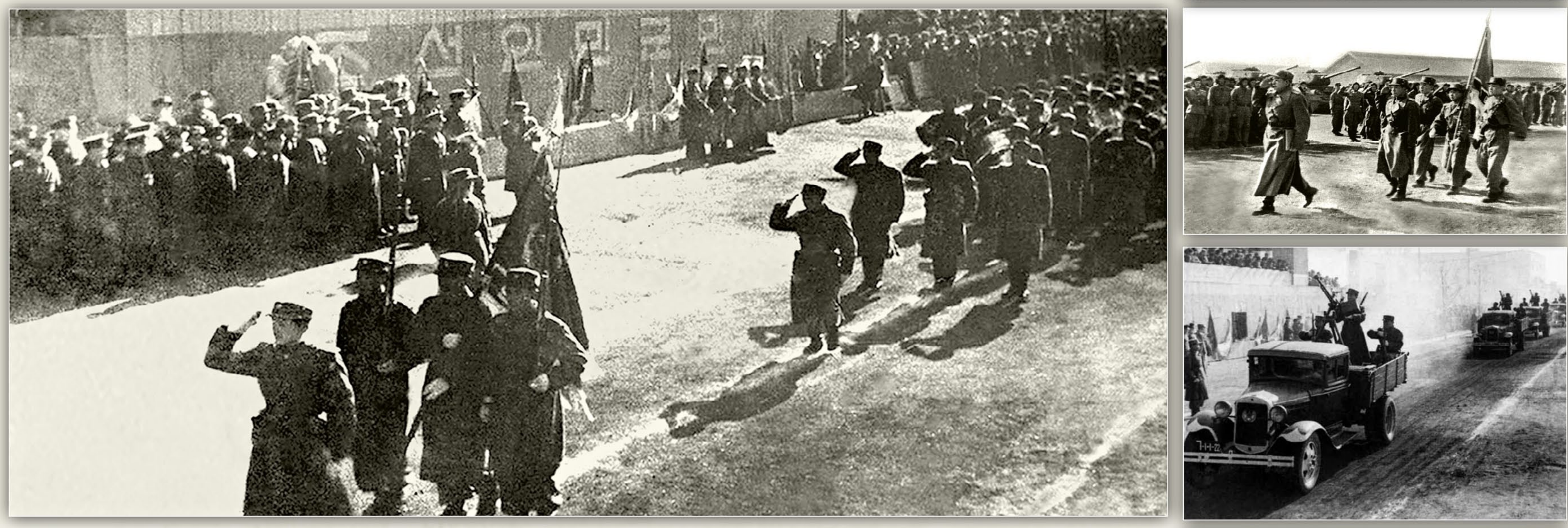
The first military parade of the Korean People's Army took place at the plaza in front of the then Pyongyang Railway Station to mark its founding on February 8, 1948

by dint of his extraordinary ideas and energetic leadership. On February 8, 1948 a military parade took place at the plaza of the then