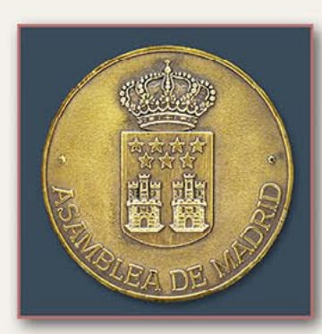
Gold Medallion of Madrid Assembly (Spain) July 28, 1992