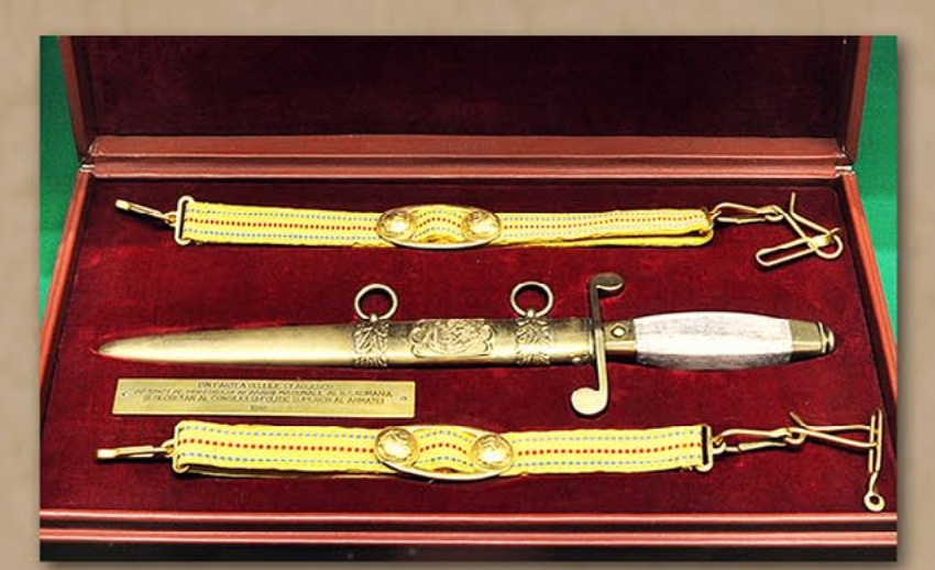
Gold dagger from Deputy Minister of National Defence and Secretary of the Supreme Political Council of the Romanian Army of the Socialist Republic of Romania May 1986