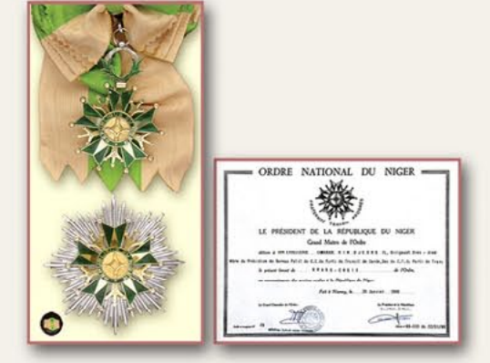
National Grand Cross Order and its certificate (Niger) September 20, 1986