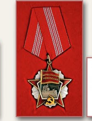
Order of October Revolution and its certificate (Russia) October 9, 1997