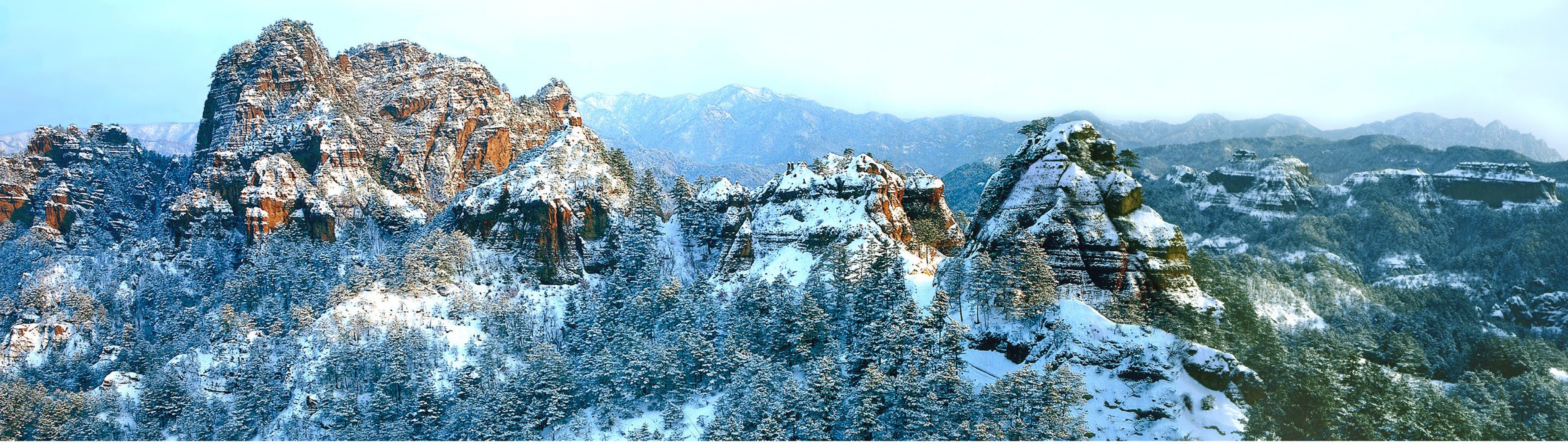
Snow-covered mountain ranges of Inner Chilbo viewed from the Sungson Rock

Winter has set in, and Mt Chilbo, one of the six celebrated mountains in Korea, presents another distinctive scenery.