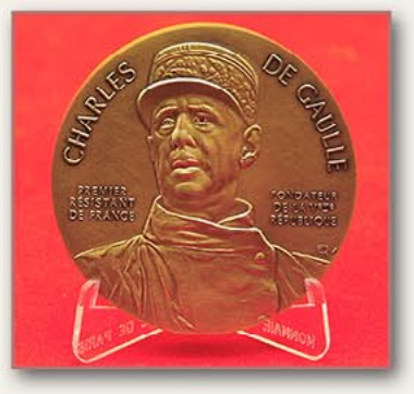
100th Birthday of de Gaulle Commemorative Medallion (France) October 6, 1990

Gold Medallion of Josip Broz Tito (Yugoslavia) February 16, 1987