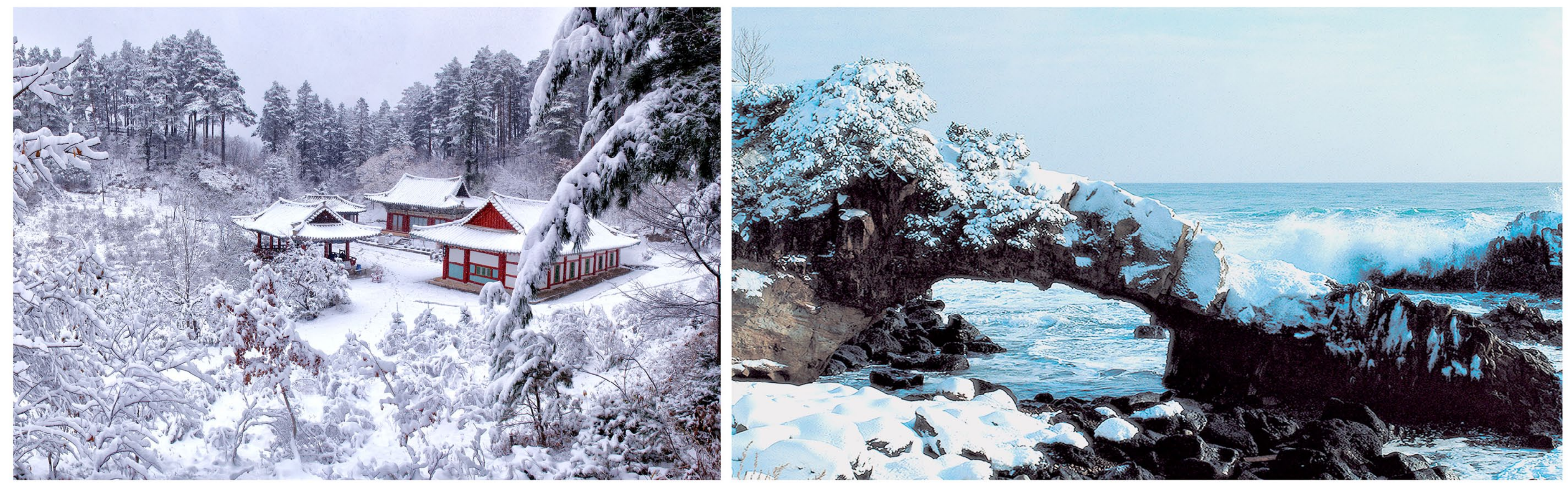
Hoar frost at the Kaesim Temple