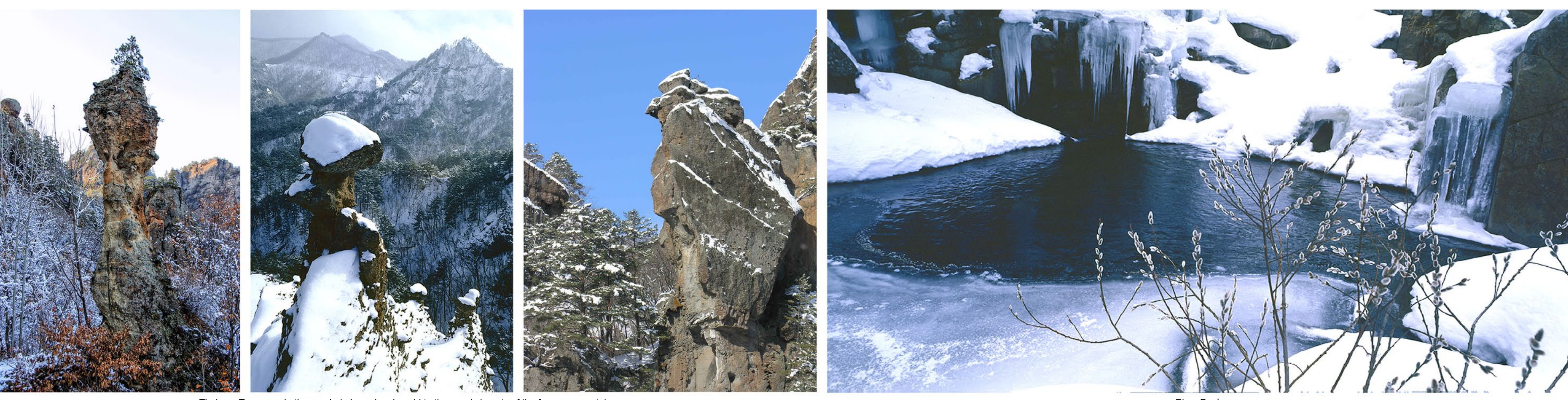
Thajong, Taemo and other myriad-shaped rocks add to the scenic beauty of the famous mountain