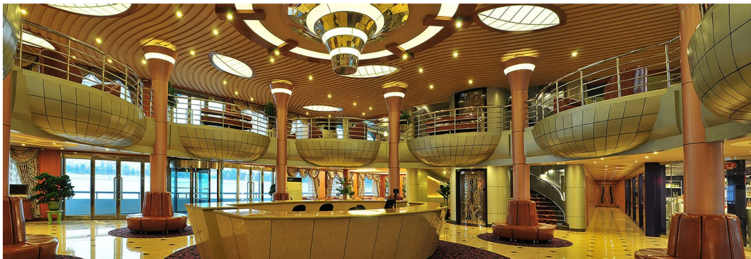
Interior of Mujigae