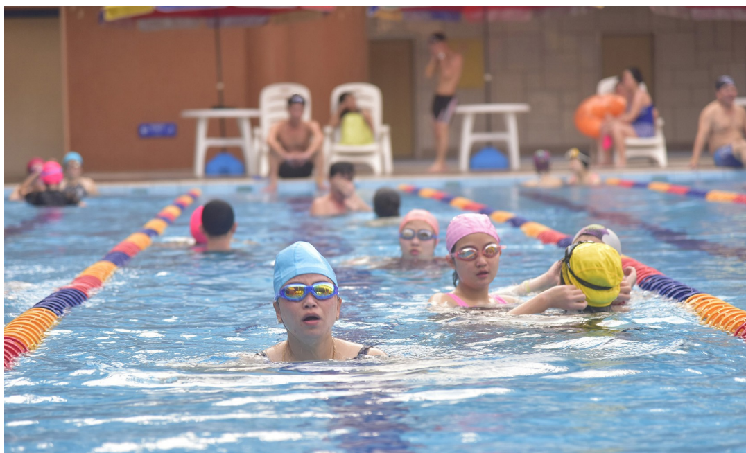
Pyongyang citizens enjoying themselves in the Munsu Water Park