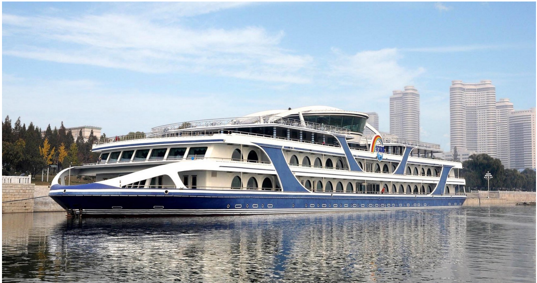
Full-service ship Mujigae