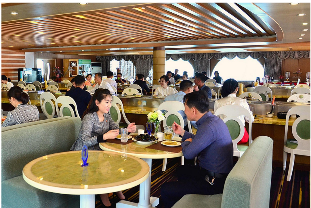
Pyongyang citizens enjoying themselves on board Mujigae