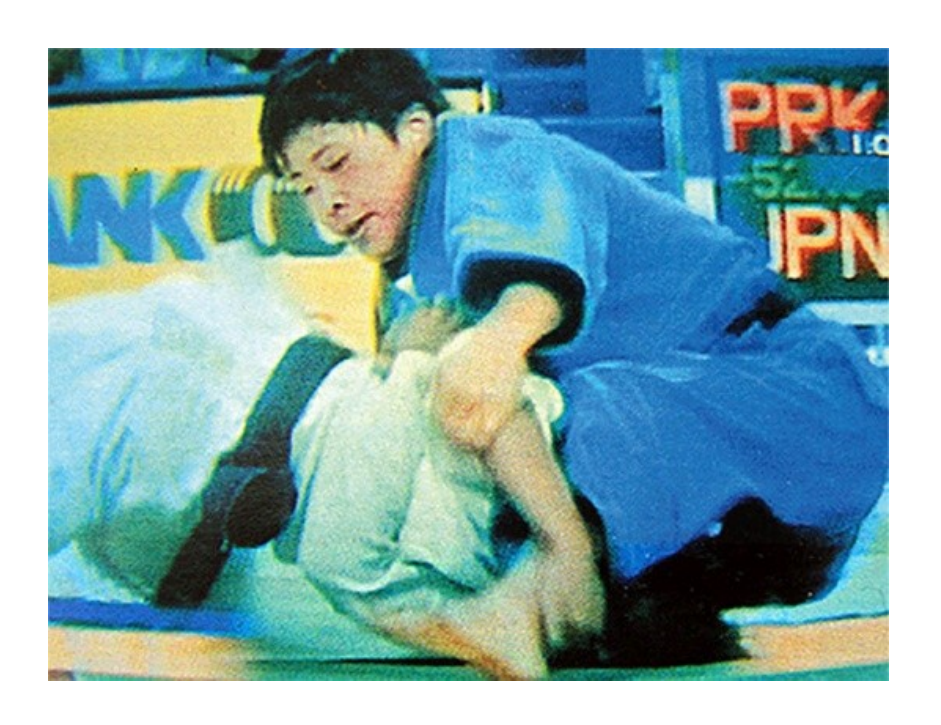
First place in the 48-kg category of women's judo event at the 26th Olympic Games