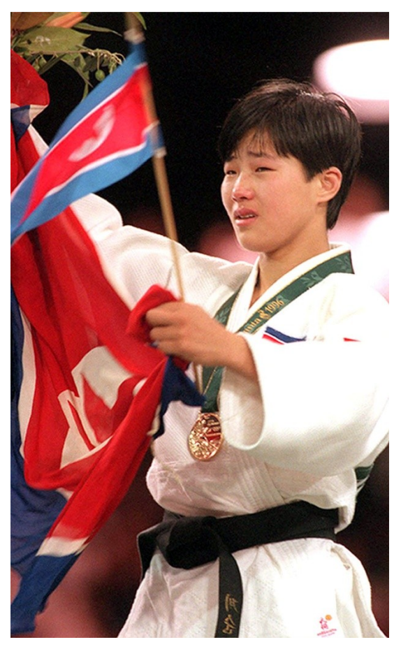
First place in the 48-kg category of women's judo event at the 26th Olympic Games