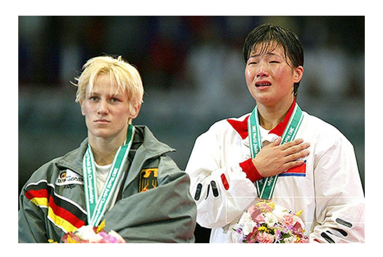
First place in the 57-kg category of women's event at the world judo championships in Juche 92 (2003)