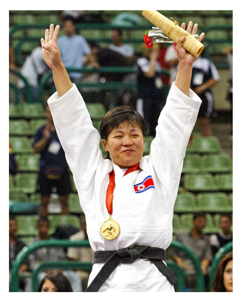
First place in the 57-kg category of women's event at the world judo championships in Juche 94 (2005)