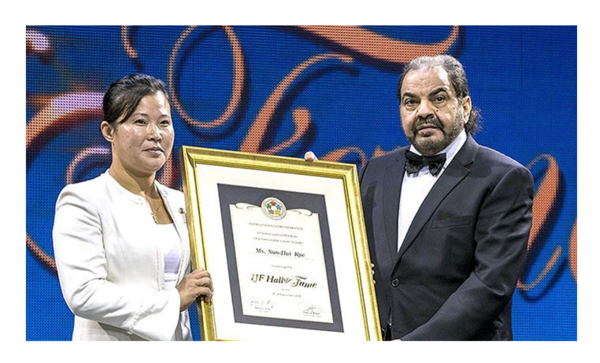
Won the International Judo Federation Hall of Fame in 2018