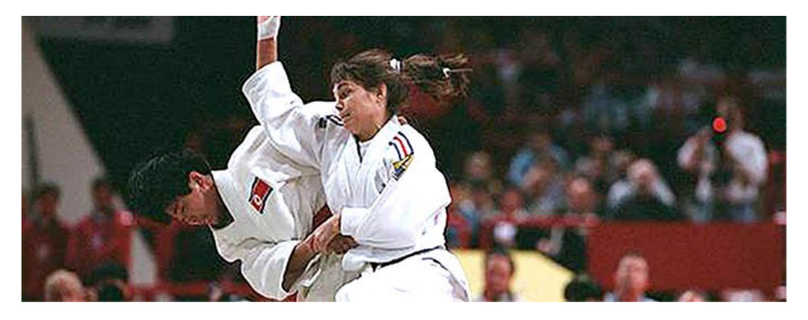
First place in the 52-kg category of women's event at the world judo championships in Juche 90 (2001)