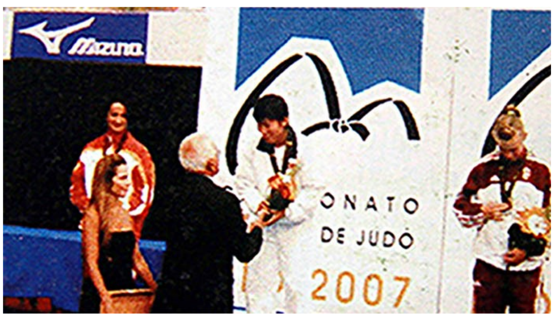
First place in the 57-kg category of women's event at the world judo