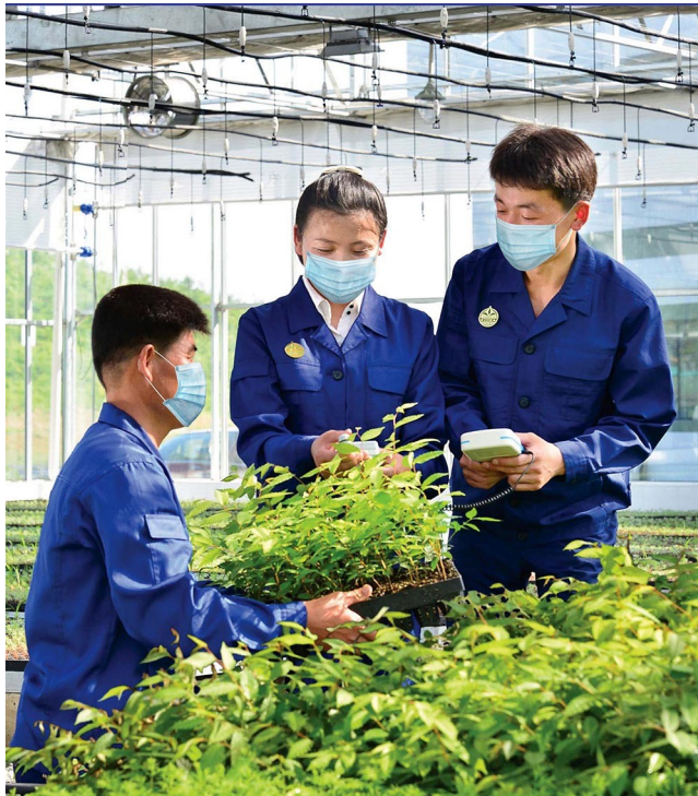
Producing saplings of trees of good species