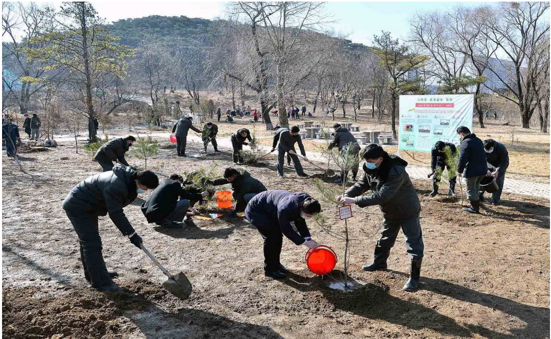
On a Tree-Planting Day