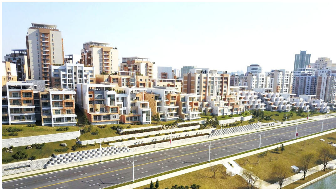
Part of the newly-built Pothong Riverside Terraced Houses District in Pyongyang