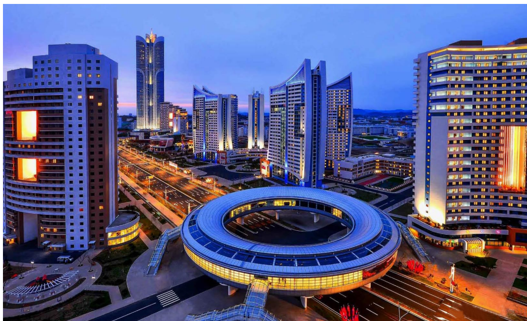
Night view of Songhwa Street inaugurated in April this year